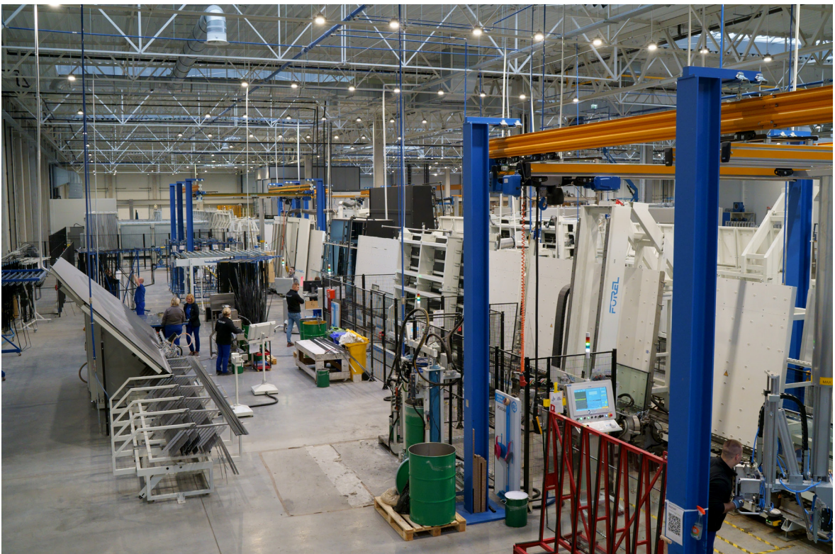
The production plant of POLFLAM®